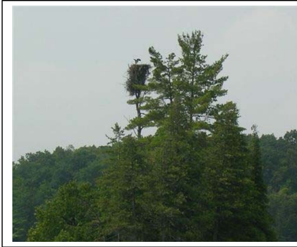
The osprey nest (between the dam and McLeod's Island).