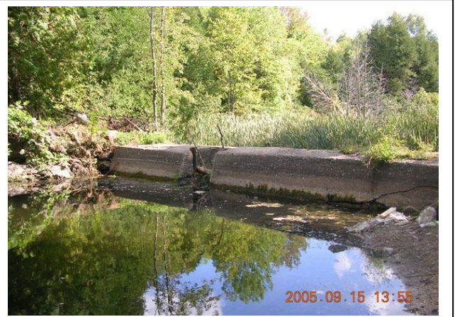
The dam (September 15, 2005) when water was at its lowest point.

Property Taxes: We will do some more research on what is happening re. property taxes, and report to you in the Fall newsletter. There may be some changes to the way property is assessed in the province, and there may be some results from the pressure being brought to bear by groups such as FOCA.