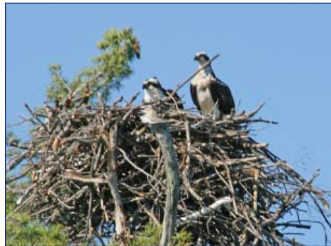
△ Osprey pair 'face off' the paparazzi.

Following a successful meeting last year at the Lion's Hall in Verona we are returning there for our annual general meeting in August (see details and directions overleaf). We are reaching a critical point in our deliberations over the lake plan and this venue provides a more suitable place to present the draft plan and get feed back from you - our members.