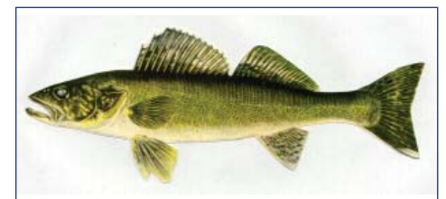
△ Pickerel prospects may be improved.

Part of the answer may be that two streams that flow into the lake have become blocked either by silt or dams, both beaver and man-made. The pickerel cannot ascend these streams in late winter and early spring to lay their eggs.